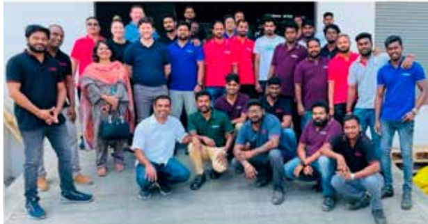
Flexco Team at Chennai