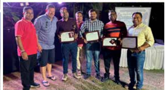
Moments captured during the Gala dinner and local Sales Award winning teams