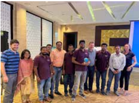
Global Excellence Award winners - Culture Ambassadors-India team