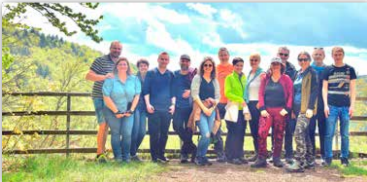
The first short break was at the Schleicherhütte. The view over Albstadt-Ebingen was beautiful.