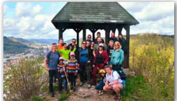
The next break was the Schlossfelsenturm. The view was even better from the top of the tower.

We look forward to the next events of our culture group. Events like this are really good for getting to know colleagues better and strengthening team spirit.