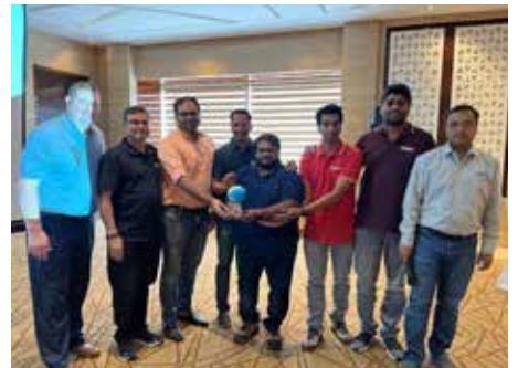
The Global Excellence Award winning team for Customer Centered for their swift response to customers.