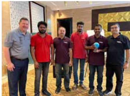
The Global Excellence Award winning team for PUN-M development for global market.